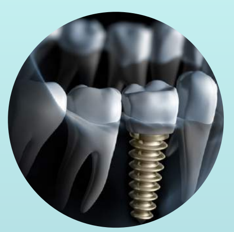
Implant Placement & Restoration