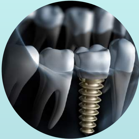
Implant Placement & Restoration