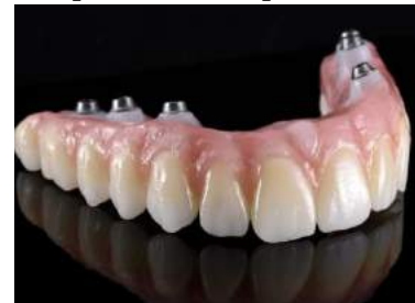
Conventional upper denture