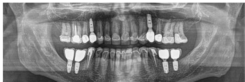
Single tooth implant